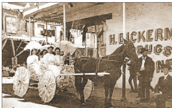
Ladies aboard a carriage at Pine and Commercial streets.