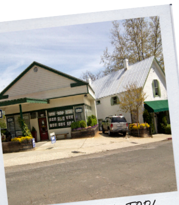
Come see us at the TOP! 436 and 432 Broad St.