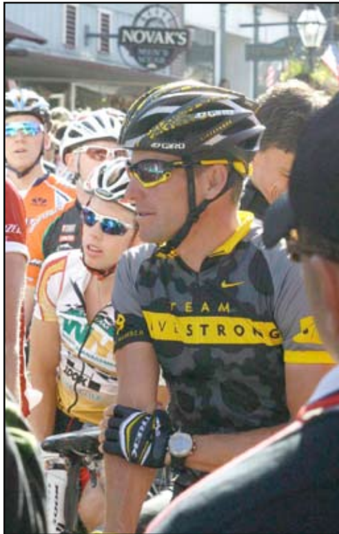
LANCE ARMSTRONG • FATHER'S DAY 2009 Cycling Great Will Be Here Next May